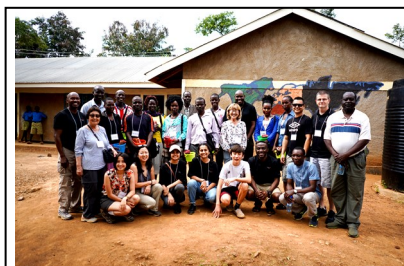
Digital Promise Initiative Expands