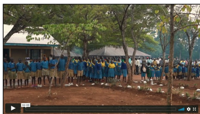
School Lunch Program Develops